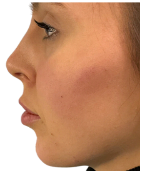
Mid-lower face contour