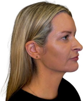
Lifted & rejuvenated