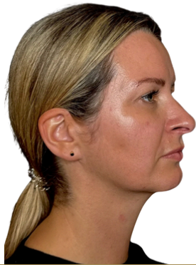
Improve subtle signs of ageing