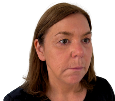
Tighter, lifted & rejuvenated