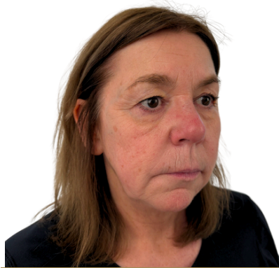
Address skin laxity and volume