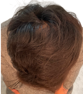
3 Months Later