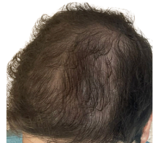
6 Months Later