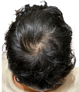
6 Months Later